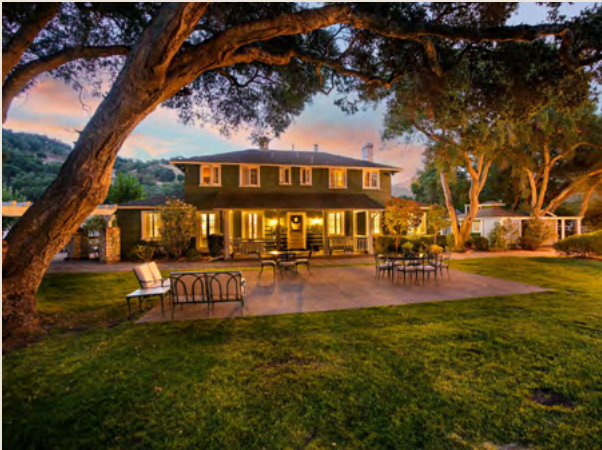
PADDOCK HOUSE BACK LAWN