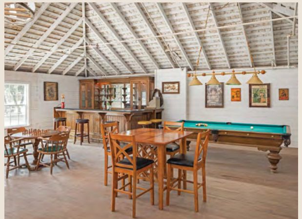
THE LOFT GAME ROOM